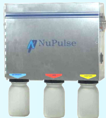
Model 31 Hi Flow