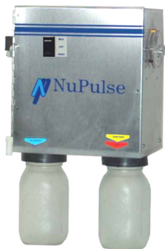
Model 12 & 32 Hi Flow