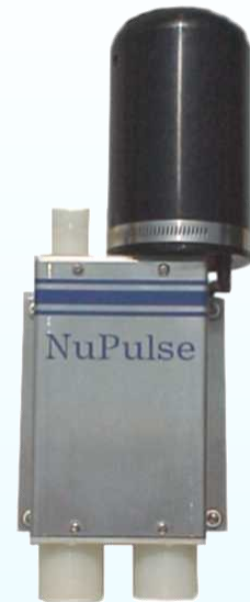
Model 6 Wall Mount Diverter Valve

The Whisper Jet provides quiet, precise air injection into the milking system while it is washing. It has an easy to adjust timer for setting the on and off times so the best washing action can be achieved. Vacuum operation eliminates electrical components from the wet, steamy environment reducing break-downs and maintenance costs.