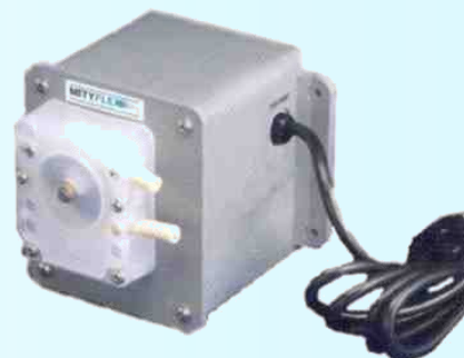
Hi-Capacity Peristaltic Pump—35 oz. per minute