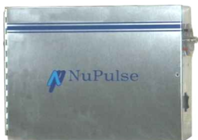
Model 23 Control Panel