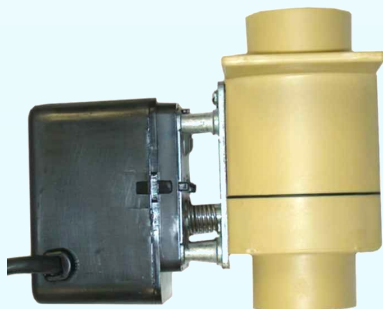
Motorized Drain Valve

The Motorized Drain Valve connects to the wash sink drain and opens and closes to fill the vat or drain it. A small 110 VAC motor with gear drive operates the valve to open and a spring makes it close. It can be changed to make it a normally open valve as well.