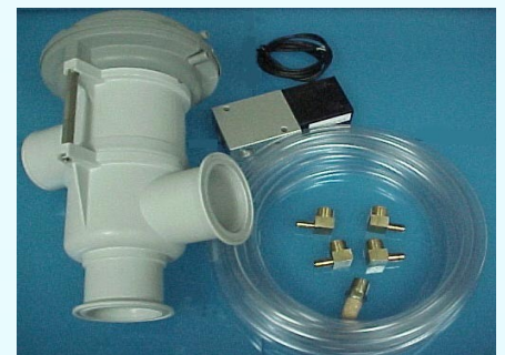
2" Wash Diverter Valve

The 2" Wash Diverter Valve also directs wash solution to the drain or to the wash vat. It uses a vacuum operated diaphragm to control the valve in a secure, leak proof position. Capacity is up to 60 milker units.